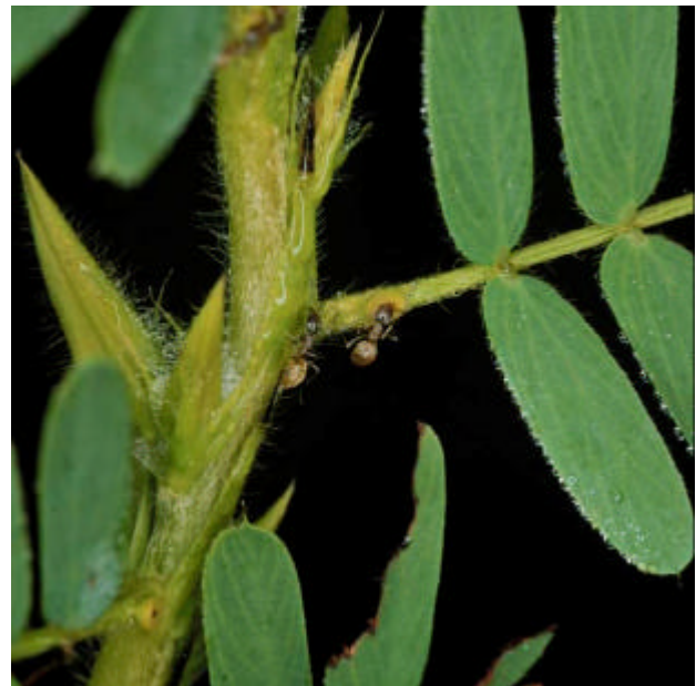
Ants utilizing an extrafloral nectary on the Partridge Pea ( Chamaecrista fasciculata ).