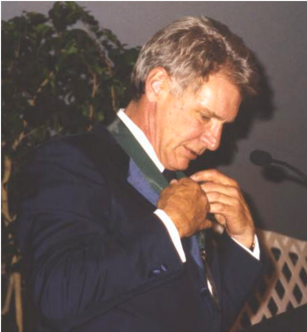
Harrison Ford with the World Ecology Award, presented by the International Center for Tropical Ecology at a gala dinner held at the Missouri Botanical Garden.