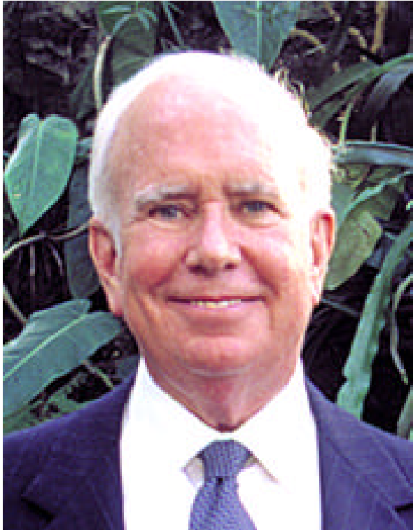
Dr. Peter H. Raven, Director, Missouri Botanical Garden

President Clinton honored Dr. Peter H. Raven , Director of the Missouri Botanical Garden and Englemann Professor of Botany at Washington University by naming him to receive the National Medal of Science, the nation's highest scientific honor. Peter Raven, a member of the ICTE's Advisory and Scientific Boards, is a pre-eminent scientist in plant systematics and evolution, and has published over 550 books and papers. He introduced, with his colleagues, the concept of co-evolution, which helped refocus much subsequent evolutionary research based on co-adaptation between plants and animals. Peter Raven is active in worldwide efforts to raise the visibility of science and to protect the environment. He is a member of President Clinton's Committee of Advisors on Science and Technology and is the chairman of the National Geographic Society's Committee for Research and Exploration. He is president-elect of the American Association for the Advancement of Science, the world's largest organization of