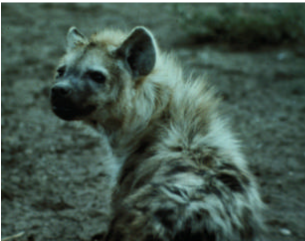
Spotted hyena, Serengeti National Park