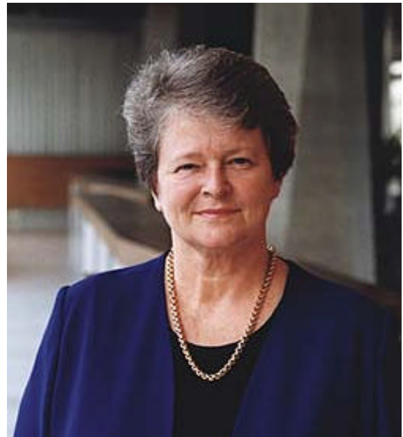
Dr. Gro Harlem Brundtland

Key mission? I see WHO's role as being the moral voice and the technical leader in improving health of the people of the world. Ready and able to give advice on the key issues that can unleash development and alleviate suffering, I see our purpose to be combating disease and ill-health—promoting sustainable and equitable health systems in all countries".